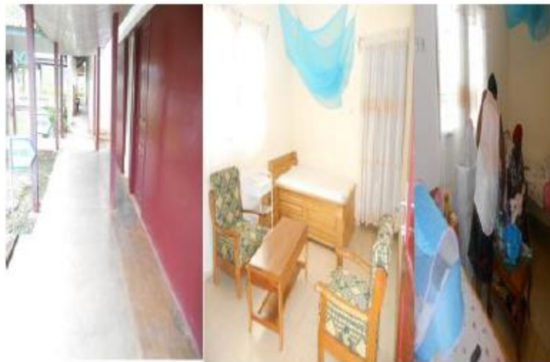
Figure 4. District hospital kumba

The district hospital Kumba have suffered much for long due to the absence of a private ward which made many personalities not accept to go through admission. But with the advent of PBF project in the south west region and subsequent coaching held in this Health facility, they are now proud of having VIP wards which has led to the high demand of private wards as seen above.