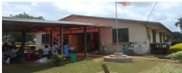
Figure 2. CMA with One ward

Before, there was only one building for the CMA (Sub Divisional Medical Health Center). This made activities very difficult because the wards were very small and not many to accommodate the population using this health facility. Men and women sleep in the same ward together with children.