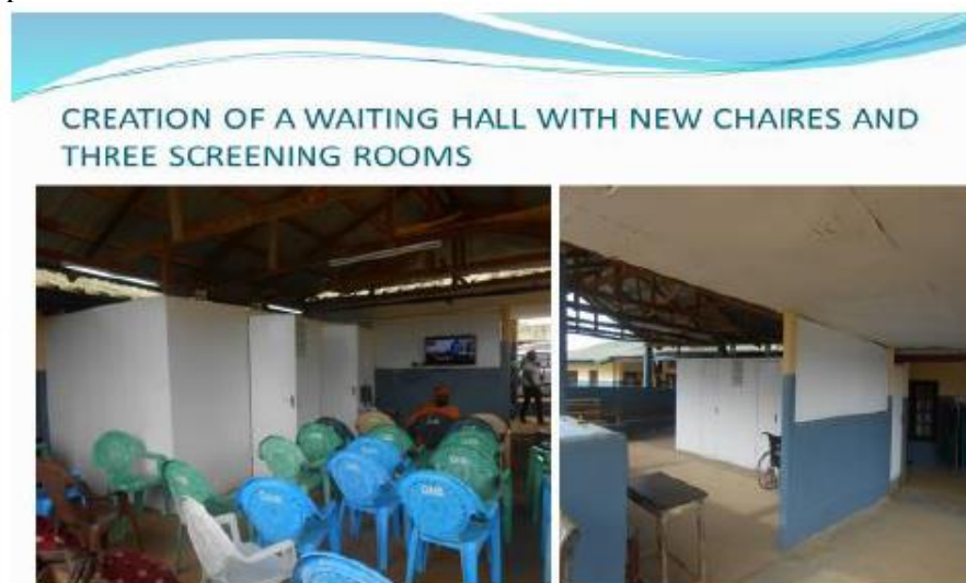
Figure 6. Current situation

The Out-Patient Department (OPD) situation at the District Hospital Kumba (DHK) look like this before the implementation of PBF, which posed a problem in terms of delivery of health care and comfort of the patients.