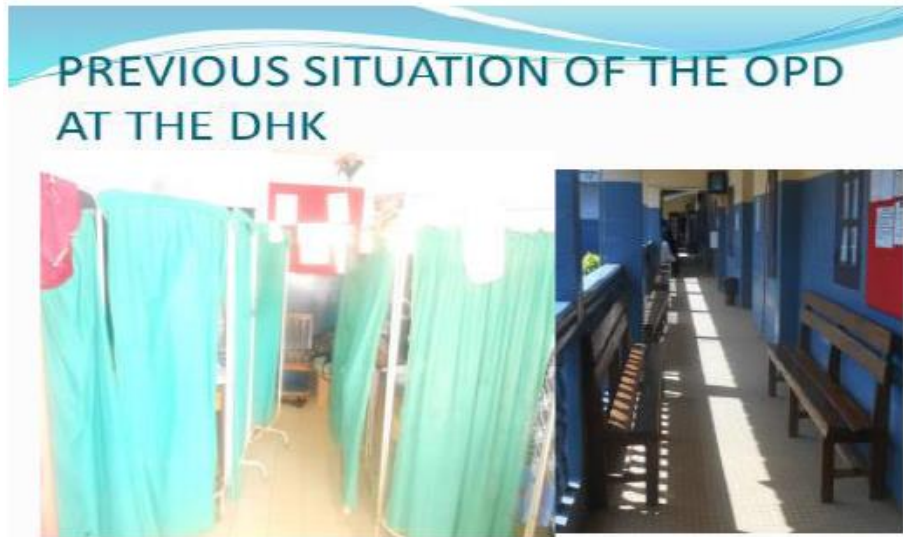
Figure 5. Previous situation of the OPD at the DHK

The Out-Patient Department (OPD) situation at the District Hospital Kumba (DHK) look like this before the implementation of PBF, which posed a problem in terms of delivery of health care and comfort of the patients.