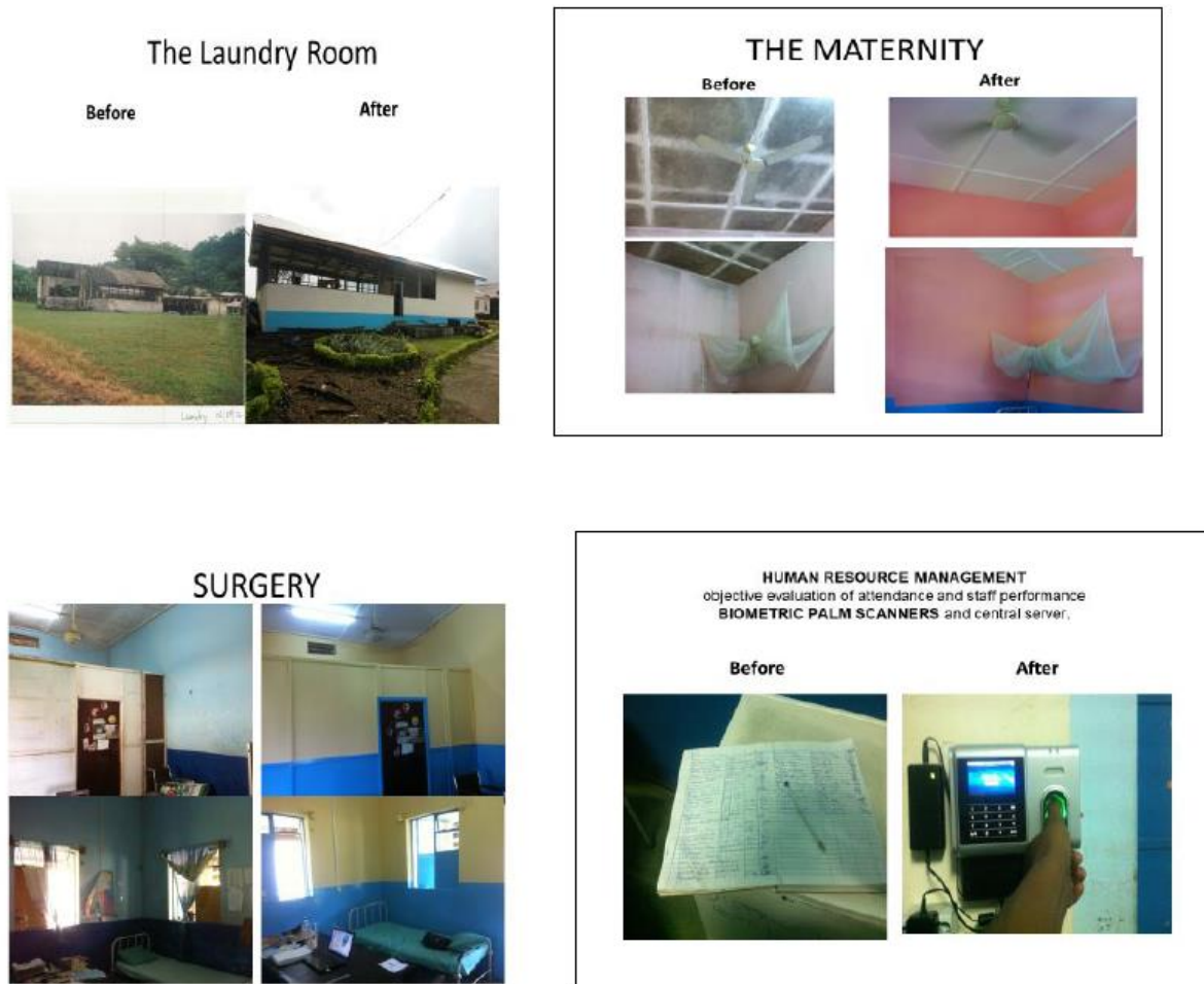
Figure 7. Improvement in Limbe District Hospital